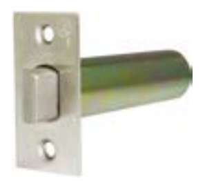
LSL03N 5" Spring Latch 1-1/8" Faceplate